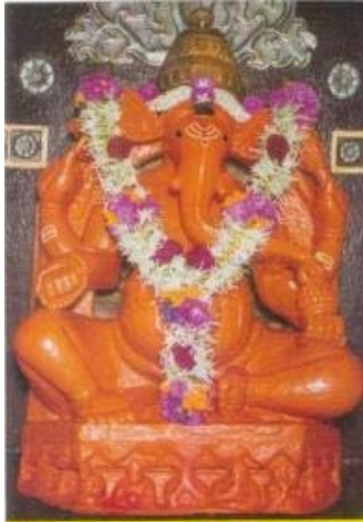
॥ श्री महागणपती-टिटवाळा ॥